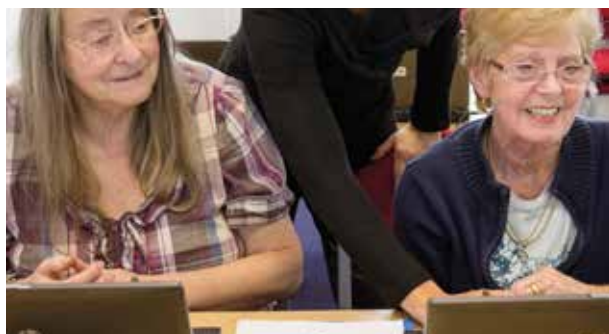
Libraries are playing a major role in equipping all ages with the digital skills they need