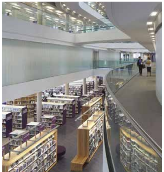
Rochdale library is now co-located alongside the council offices, cafes and private workspaces in a move that merged 33 buildings into one and won the award for best workplace in 2014