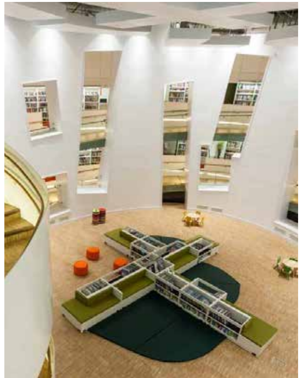
Clapham Library follows a continuous spiral around a central performance space, and includes an NHS Clinic

The Public Libraries and Museum Act 1964 places a statutory duty on your council to provide a 'comprehensive and efficient' library service for all people working, living or studying in the area who want to make use of it. This has never been formally defined, in order to allow local areas to