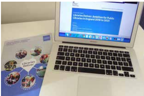
Libraries Deliver

Others may need to be reconsidered as suitable library service points. With your councillor colleagues and senior officers, you will need to consider a wide range of factors in redesigning the overall library service to be economic, efficient and effective. Within this, each library service point should be considered in terms of its: