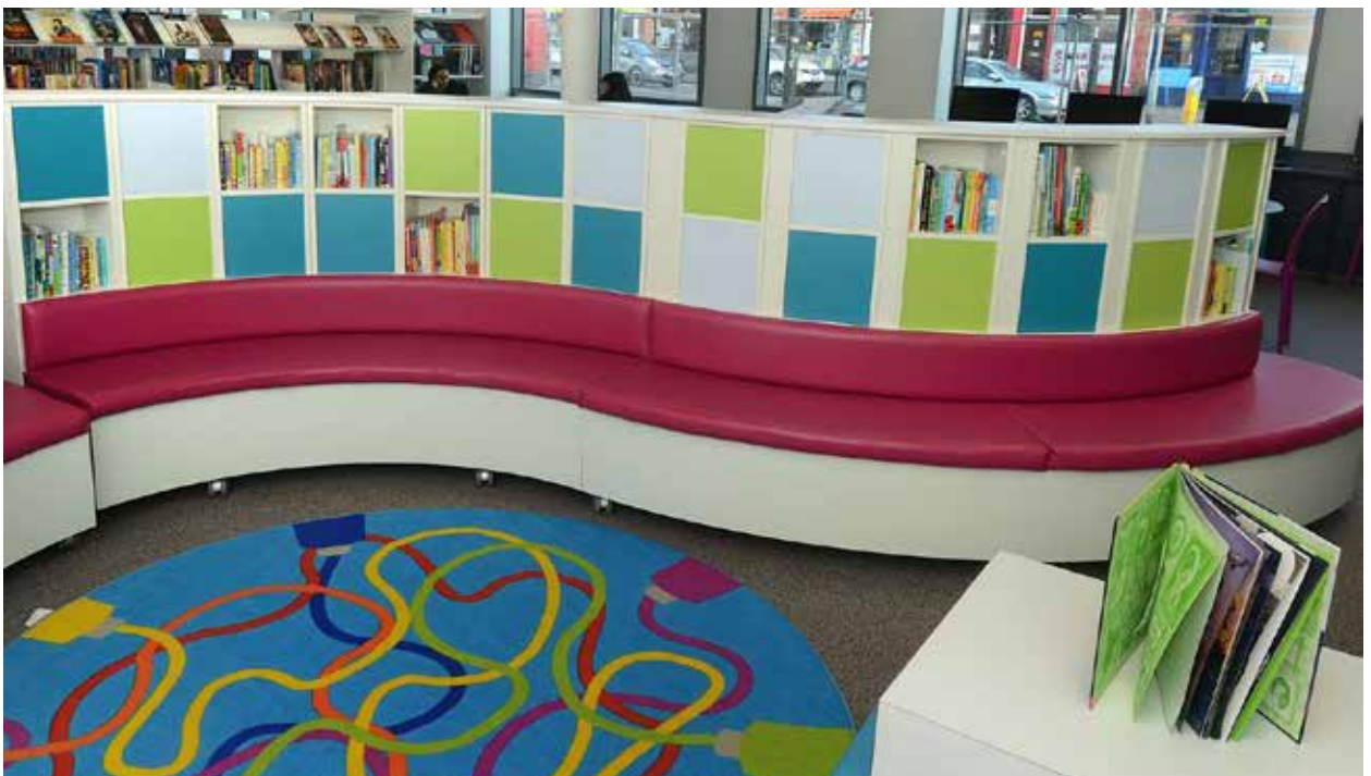
Part of the children’s area at Manchester Arcadia

The focus for all staff is the delivery of good services to the residents of Levenshulme. Since opening, the centre has been a great success with local residents and use of the library has risen dramatically with the seven day offer. The centre has achieved all of its targets and surpassed expectations. Recent performance shows a 146 per cent increase in new library members, an 80 per cent increase in visits and a 29 per cent increase in book lending. The 2016 PLUS survey showed that 93 per cent of customers surveyed judged the interior and exterior attractiveness of the centre to be ‘good’ or ‘very good’.